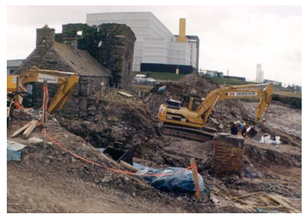
Figure 3 Beginning the remediation of Dounreay Castle

In close co-operation with a specialist archaeological contractor, the ground around the Castle was carefully excavated in slices of 20cm depth. This method allowed the safe removal of contaminated material and a detailed recording of the site archaeological history. The initial stage of the remedial works is shown in Figure 3. Remediation works completed during 1998 allowed open access to the site for the first time in 40 years (Figure 4).