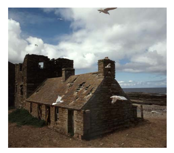
Figure 4 Dounreay Castle after remediation