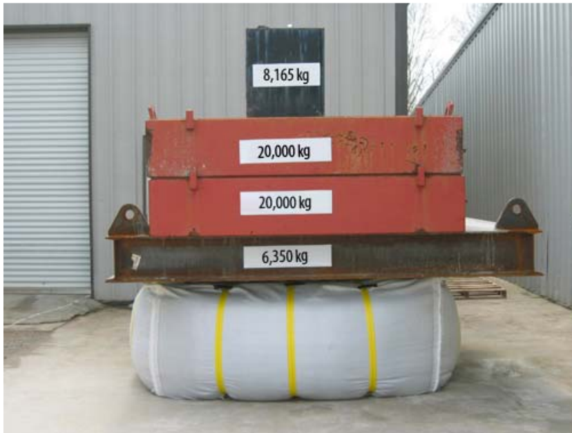
Weighing prior to drop test